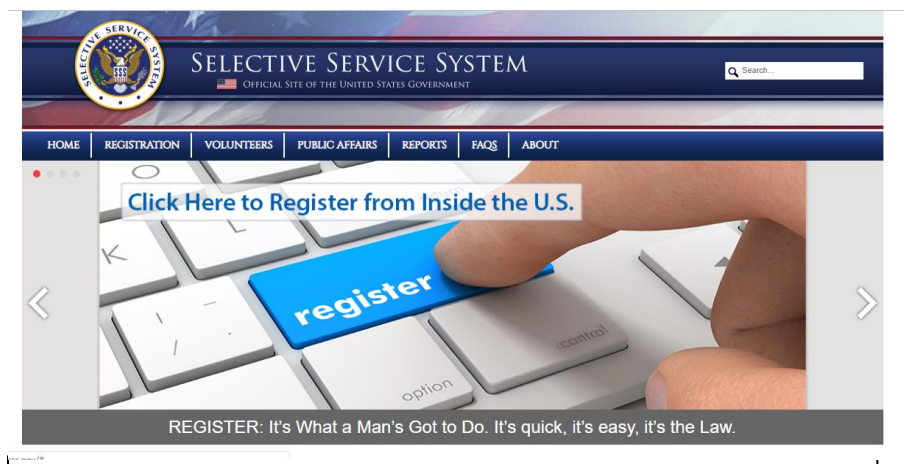
Figure 1. The 2019 SSS web site home page. Note the bottom banner "It's What a Man's Got to Do." Screenshot from <a href="https://www.sss.gov/">https://www.sss.gov/</a> accessed 1 April 2019.

"REGISTER: It's What a Man's Got to Do. It's quick, it's easy, it's the Law". This slogan is reminiscent of twentieth century war-time recruiting campaigns to join the Service, buy War Bonds, and support our troops. These words are not from an ad on the back of an old Saturday Evening Post or a vintage US Post Office poster from the twentieth century. Rather, this slogan appears on the Selective Service System web site in the year 2019, reminding young men between the ages of 18 and 25 to complete their legal obligation to register. A responsibility of US citizenship for young men, this outdated legislation excludes women, some homosexual